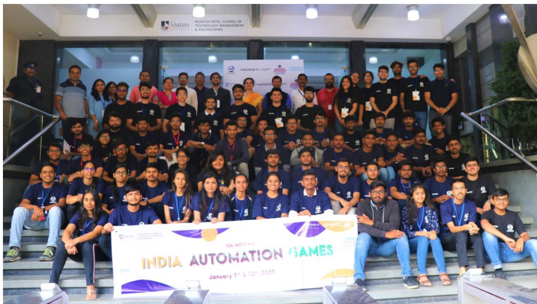
Team ISA MPSTME with the chief guests, referees, convener and participants of IAG 2020

The MPSTME section of ISA would like to thank ISA District 14 for the golden opportunity to organize the charter edition of the India Automation Games and thank them, as well as ISA Maharashtra for the constant insight and support. We believe that pulling off an event of this magnitude would have been impossible without these and we hope to receive the same in our future endeavors.