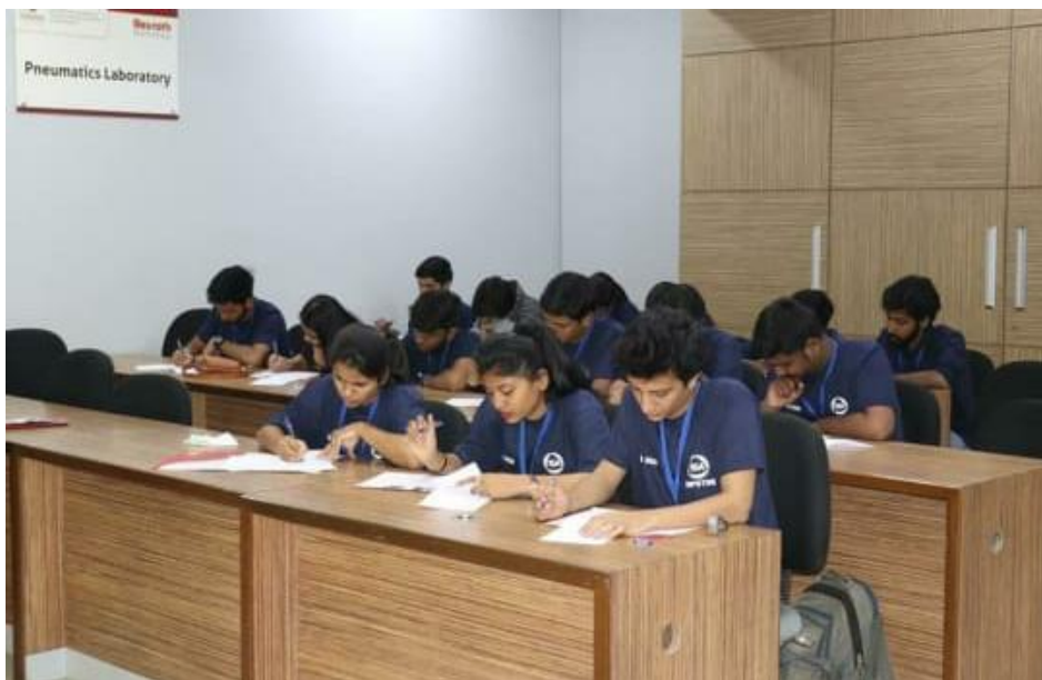
Students during the opening ceremony and orientation program for IAG 2020